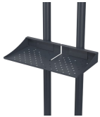
TIPSTER MULT IUSE SHELF